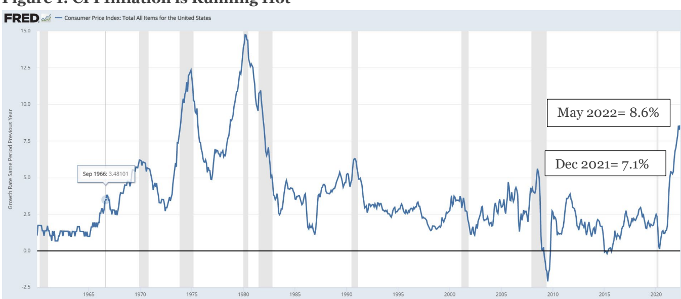
Figure 1: CPI Inflation is Running Hot